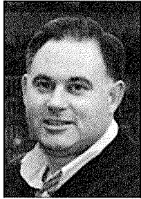
Frank Guinta Republican A

⇒ 2011, Voted Yes on Reciprocity for Carry Licenses