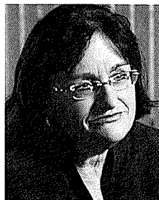
Ann Kuster Democrat * C

⇒ Voted to repeal requirement for license to carry. ⇒ Voted to authorize carry on public property ⇒ Voted for Immunity from Civil Suits from act of self-defense ⇒ Voted against further restrictions on carry on legislative facilities